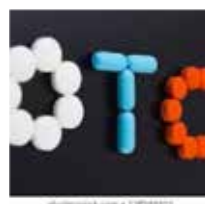
Over the Counter (OTC) & Healthcare Devices