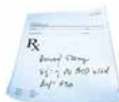
Pharmacy Terminology & Abbreviations