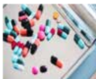
Intro to Pharmacy Practice