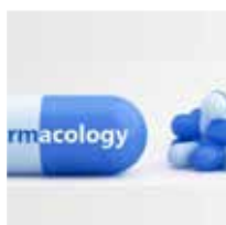
Pharmaceuticals & Pharmacology