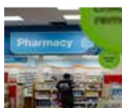
Pharmacy Communications & Customer Service